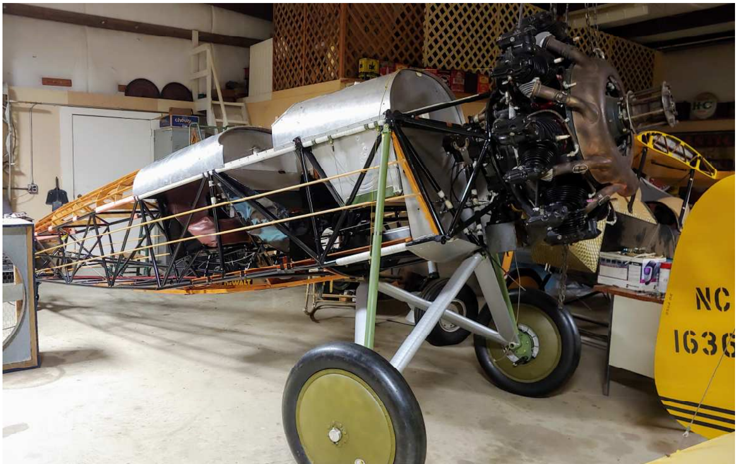
James Dean's 1928 WACO ASO, NC9500, with a Wright J6-7. Progress! Sure looks familiar!