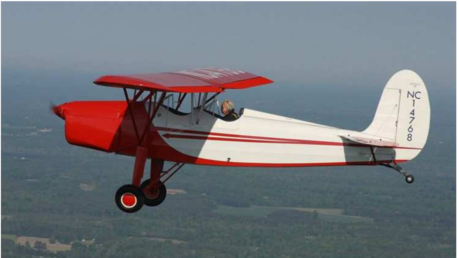
1935 Fairchild 22 NC14768 over Roxboro.